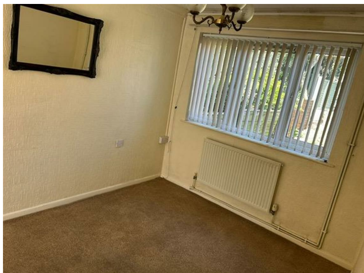
Bedroom Two 10'4" x 11'1" (3.16 x 3.40)

With a rear facing UPVC window and central heating radiator. The bedroom is of double size with built in storage cupboards which also house the central heating boiler.