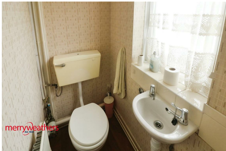
Down Stairs WC 2'10" x 4'4" (0.87 x 1.34)

With a two piece suite comprising of a hand wash basin and low flush WC. With central heating radiator and opaque double glazed window.