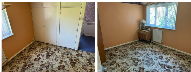
Bedroom One 11'1" x 11'1" (3.38 x 3.39)

With a front facing UPVC window and central heating radiator. The bedroom is of double size with neutral décor and carpet to the flooring.