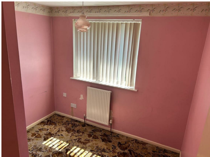
Bedroom Three 7'2" x 8'10" (2.20 x 2.71 )

With a front facing UPVC window and central heating radiator. The bedroom is of single size with built in storage cupboards and carpet to the flooring.